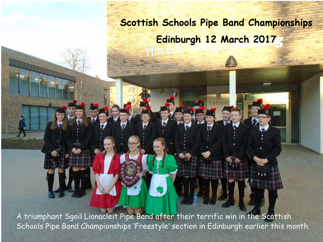
A triumphant Sgoil Lionacleit Pipe Band after their terrific win in the Scottish Schools Pipe Band Championships 'Freestyle' section in Edinburgh earlier this month.

The Freestyle section in this competition is designed to allow pipe bands to show case their creativity and provide a platform where they can utilise an unspecified and diverse range of instruments. The pupils' own creative input along with the stewardship of their