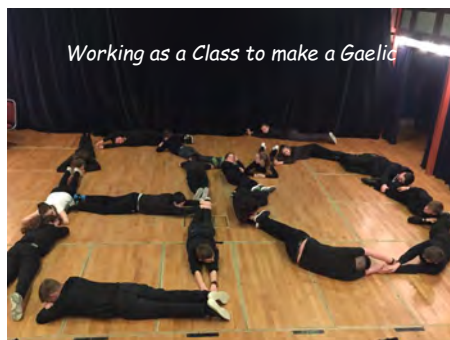
Working as a Class to make a Gaelic

"Our greatest glory is not in never failing, but in rising every time we fall"