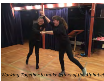
Working Together to make letters of the Alphabet

"Our greatest glory is not in never failing, but in rising every time we fall"