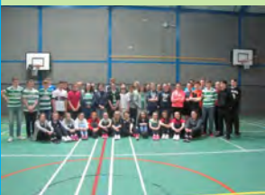
S3 PE Group

Friday 03 February 2017 was a sporty non uniform day for Staff and Pupils at Sgoil Lionacleit. Participants were encouraged to wear sports clothing and donate £1.