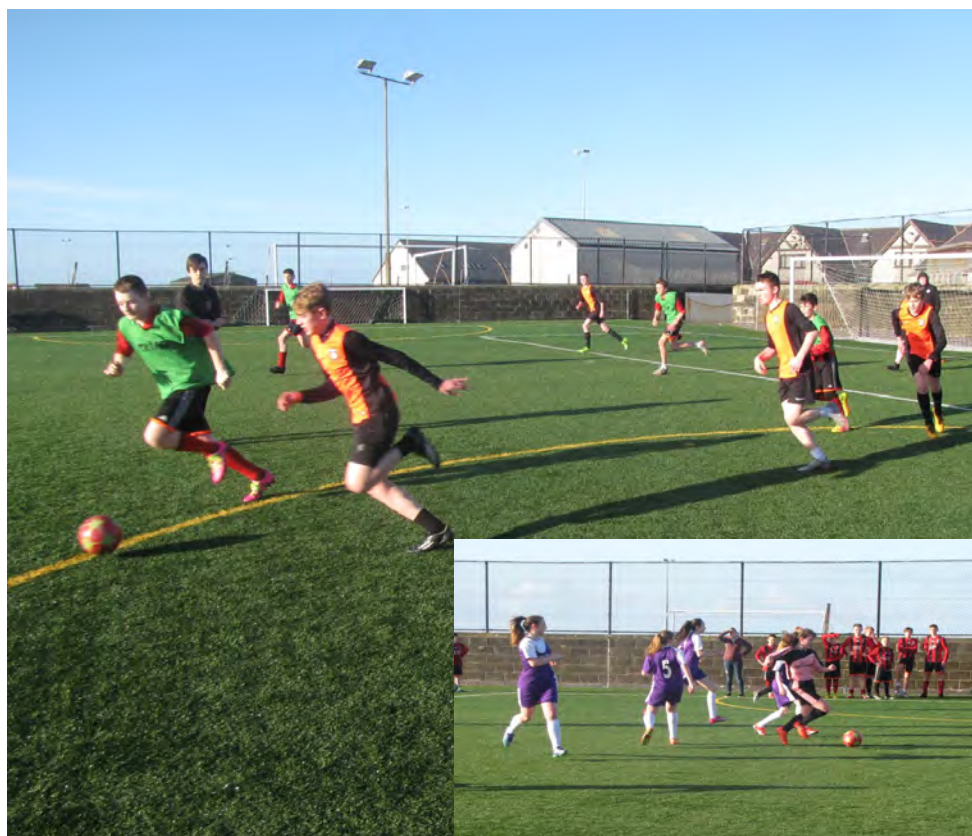
S1-3 Boys and Girls from Sgoil Lionacleit & Castlebay High