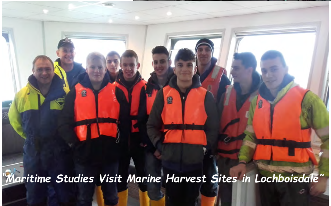
"Maritime Studies Visit Marine Harvest Sites in Lochboisdale"

"If you have built castles in the air, your work need not be lost; that is where they should be. Now put the foundations under them".