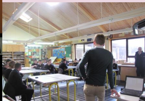
Group of 16 S4-S6 Pupils Attending